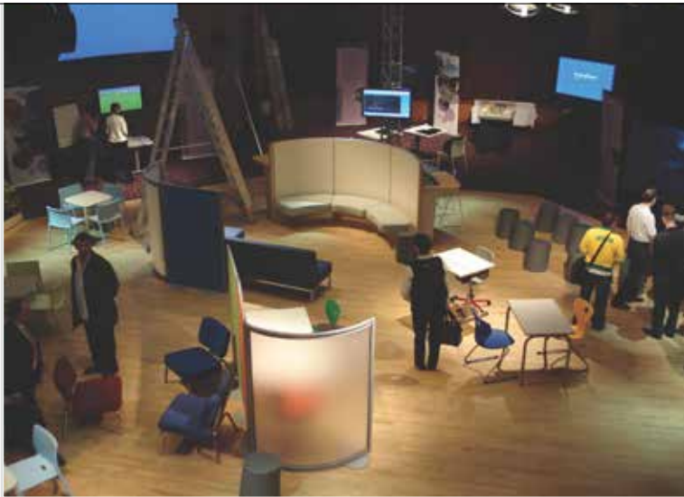
Savvy media makers